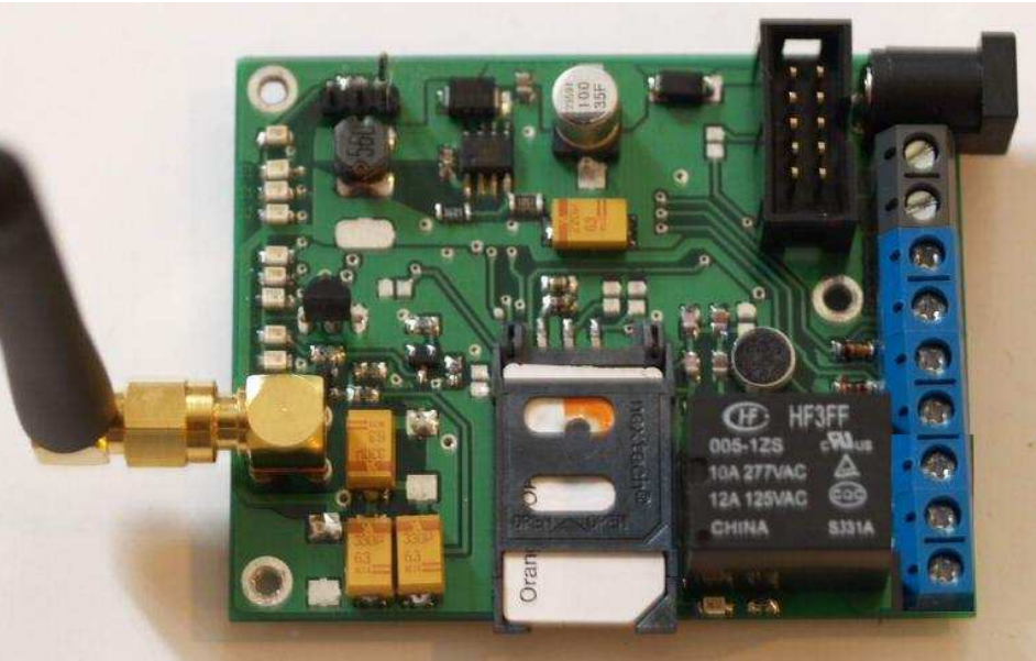
Restarter and monitoring for devices

The controler has a relay for switching devices and three inputs monitoring, for example, which you can control the power supply work buffer or other devices. There is possibility connection of an additional board with RJ45 ports (4 LAN inputs, 4 outputs LAN + PoE) or another board with 4 relays.